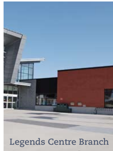
Legends Centre Branch